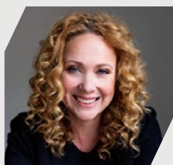
The Hon. Melissa Horne MP, Minister for Local Government