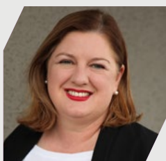
The Hon. Natalie Hutchins MP, Minister for Women