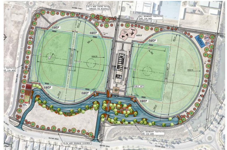
Figure 1: – Concept design

Growing Suburbs Fund contributes to a mix of infrastructure projects that have a direct benefit to communities living in the outer suburbs.