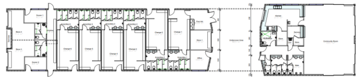
Figure 2: – Concept Design

You can find out about other Growing Suburbs Fund Projects at localgovernment.vic.gov.au/gsf