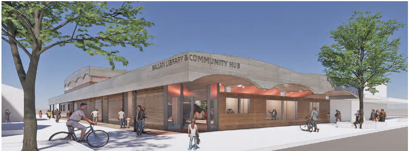
Figure 1: Artist impression Antarctica Architects

You can find out about other Growing Suburbs Fund projects at https://www.localgovernment.vic.gov.au/grants/growing-suburbs-fund