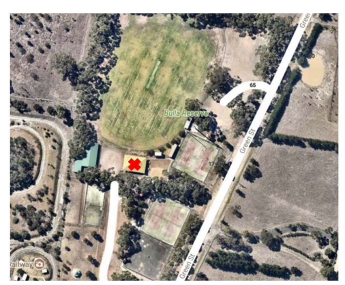
Figure 1: Aerial shot of current pavilion