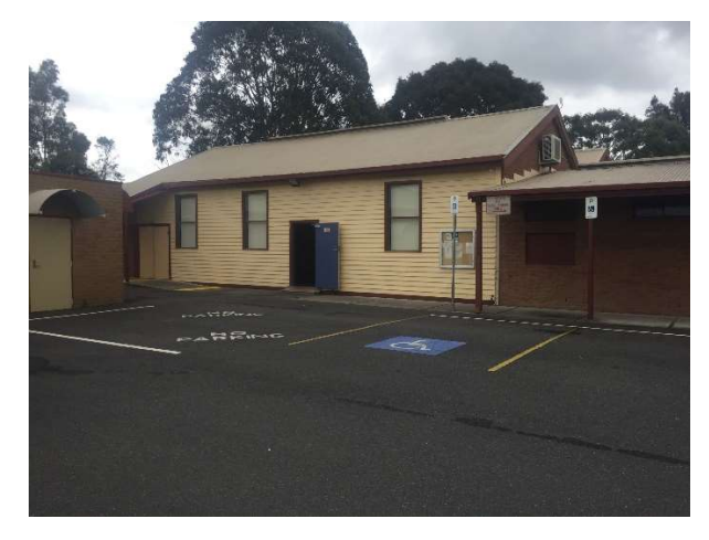
Figure 1: Hallam Recreation Reserve Hall - external view

Growing Suburbs Fund contributes to a mix of infrastructure projects that have a direct benefit to communities living in the outer suburbs.