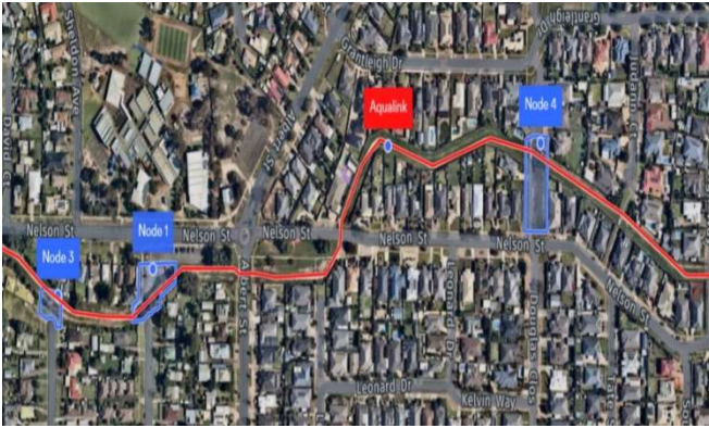
Figure 2 Project Sites