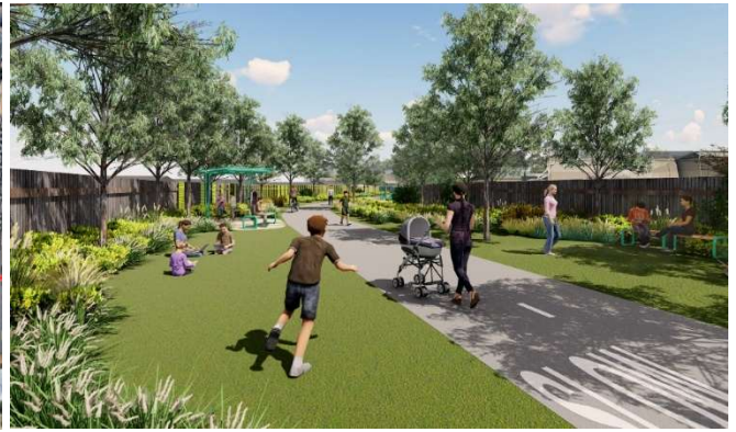
Figure 1 Concept Design Seating and Garden Beds

You can find out about other Growing Suburbs Fund projects at https://www.localgovernment.vic.gov.au/grants/growing-suburbs-fund .