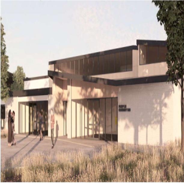
Figure 1 - Concept design