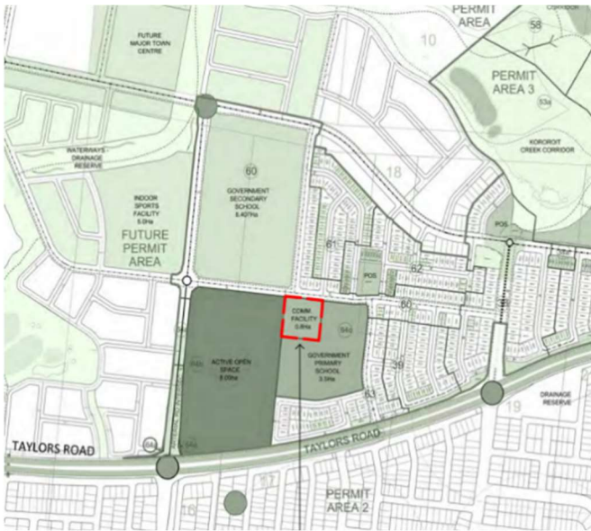
Figure 1 Location