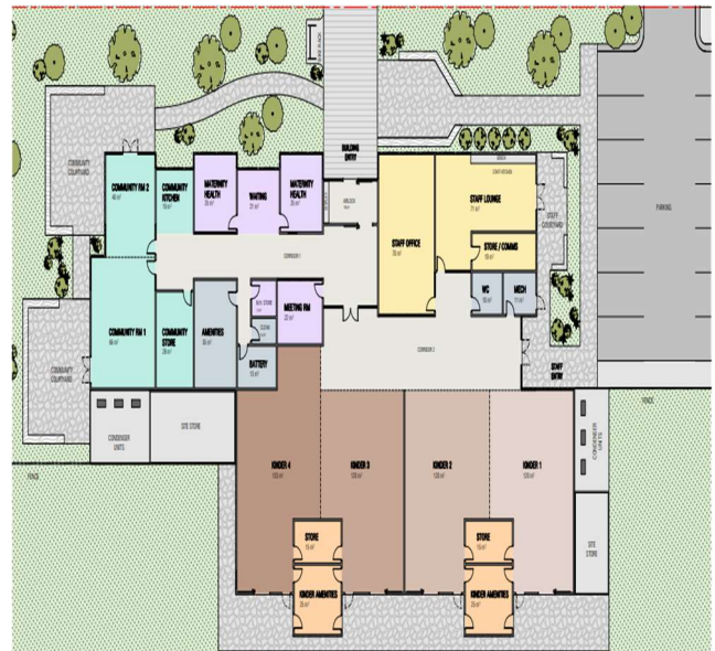
Figure 2 Concept Design

You can find out about other Growing Suburbs Fund projects at https://www.localgovernment.vic.gov.au/grants/growing-suburbs-fund .