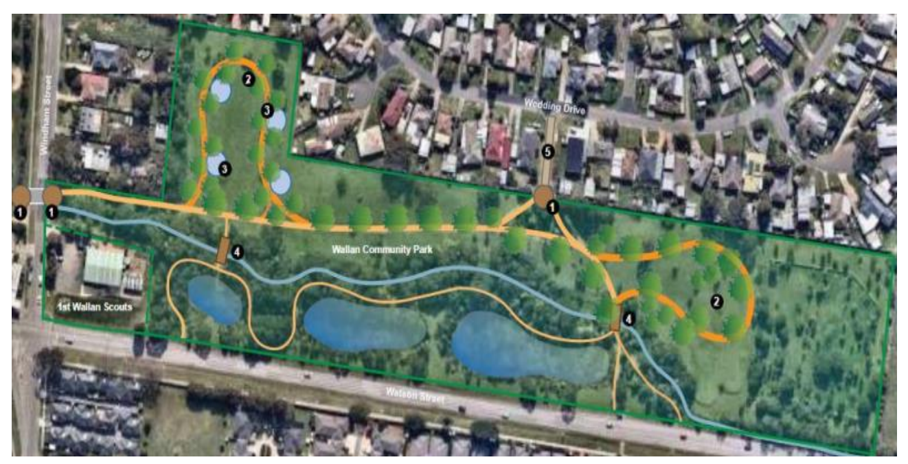
Figure 1: Concept design Jeavons Landscape Architects

You can find out about other Growing Suburbs Fund projects at