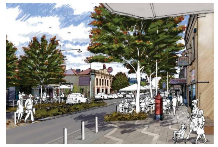
Figure 2 – Kilmore Rejuvenation – Sydney & Mill Street Plaza Concept Design (Mitchell Shire Council)

Figure 1 – Kilmore Rejuvenation – Concept Design (Mitchell Shire Council)