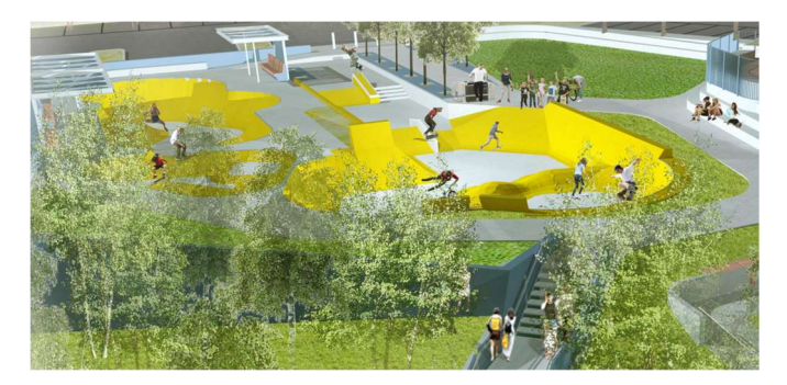
Figure 2: EH2 - Design - Artist Impression

You can find out about other Growing Suburbs Fund Projects at localgovernment.vic.gov.au/gsf