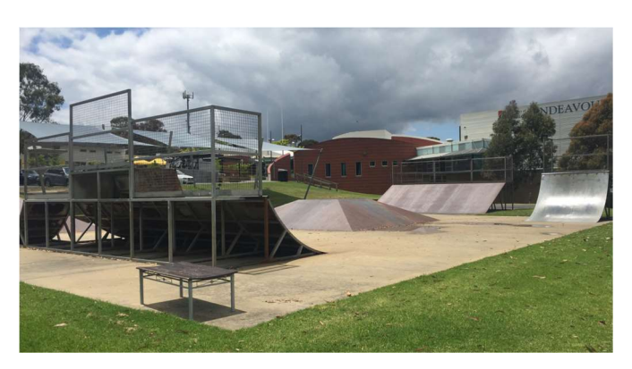
Figure 1: EH2 - Pre- construction skatepark view

Growing Suburbs Fund contributes to a mix of infrastructure projects that have a direct benefit to communities living in the outer suburbs.