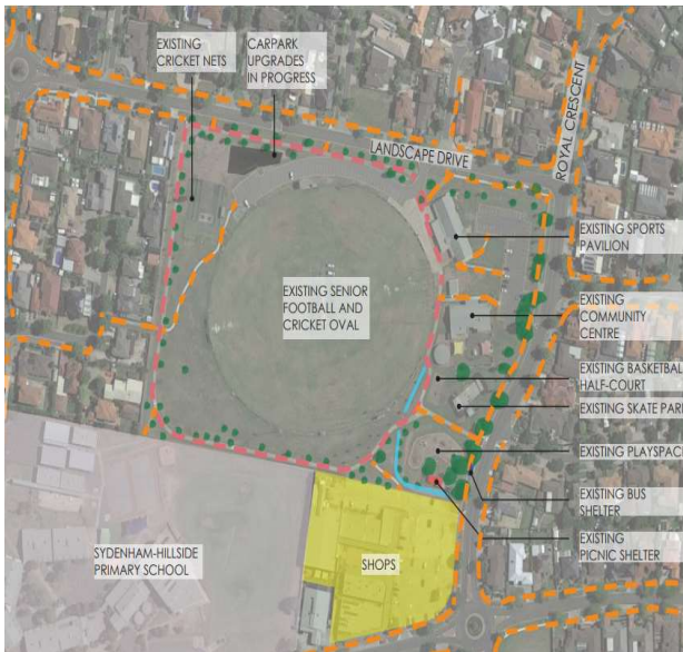
Figure 1 – Site Location