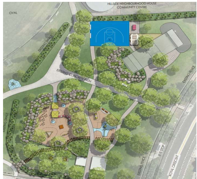
Figure 2 - Concept design

You can find out about other Growing Suburbs