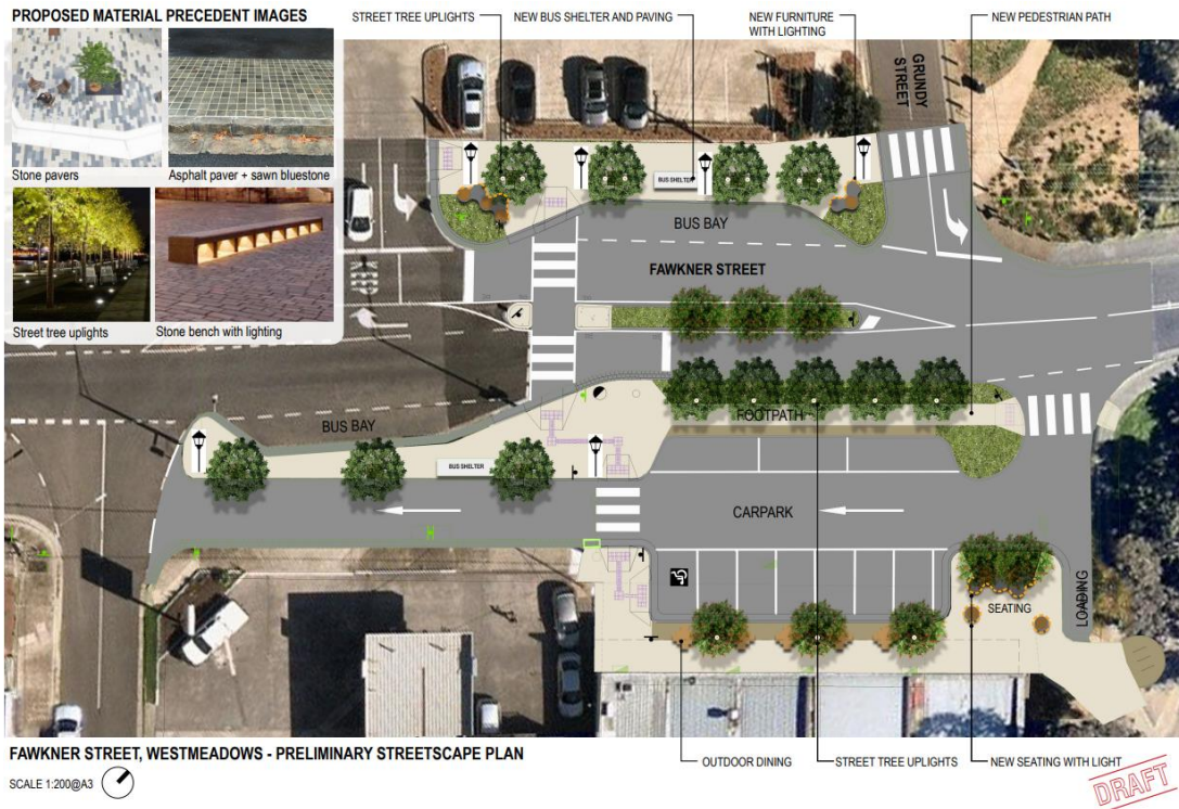
Figure 1 – Concept design

You can find out about other Growing Suburbs Fund projects at https://www.localgovernment.vic.gov.au/grants/growing-suburbs-fund