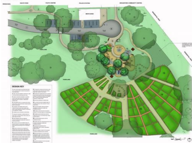
Figure 2 – Broadford Community Garden – Concept Design (Melton City Council)

© The State of Victoria Department of Environment, Land, Water and Planning 2020