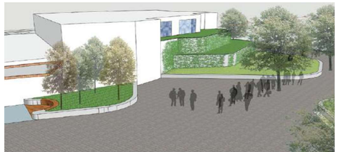
Figure 2: CWCH – Concept Design

You can find out about other Growing Suburbs Fund Projects at localgovernment.vic.gov.au/gsf .