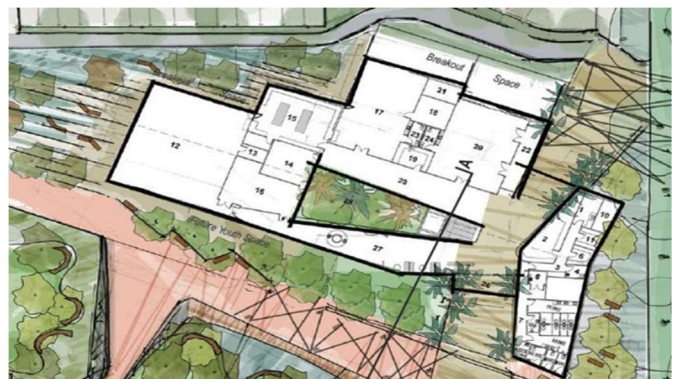
Figure 1: CWCH – Concept design

Casey City Council will receive a total of $5,100,100 for three projects under the Growing Suburbs Fund 2018-19 Round.