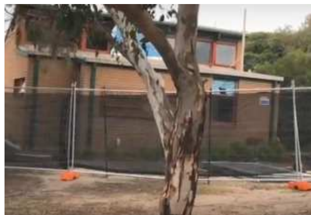
Figure 1: Chalcot Lodge Children's Centre – external view