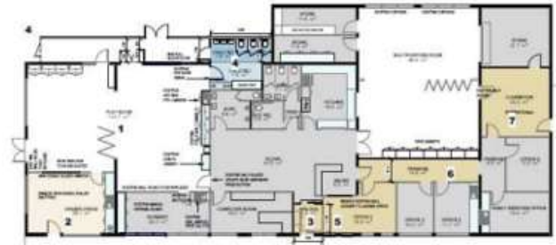
Figure 1 Proposed Floor Plan

You can find out about other Growing Suburbs Fund projects at https://www.localgovernment.vic.gov.au/grants/growing-suburbs-fund .