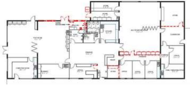
Figure 2 Existing Floor Plan