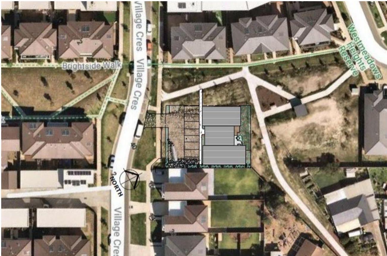
Figure 1 – Location

You can find out about other Growing Suburbs Fund projects at https://www.localgovernment.vic.gov.au/grants/growing-suburbs-fund