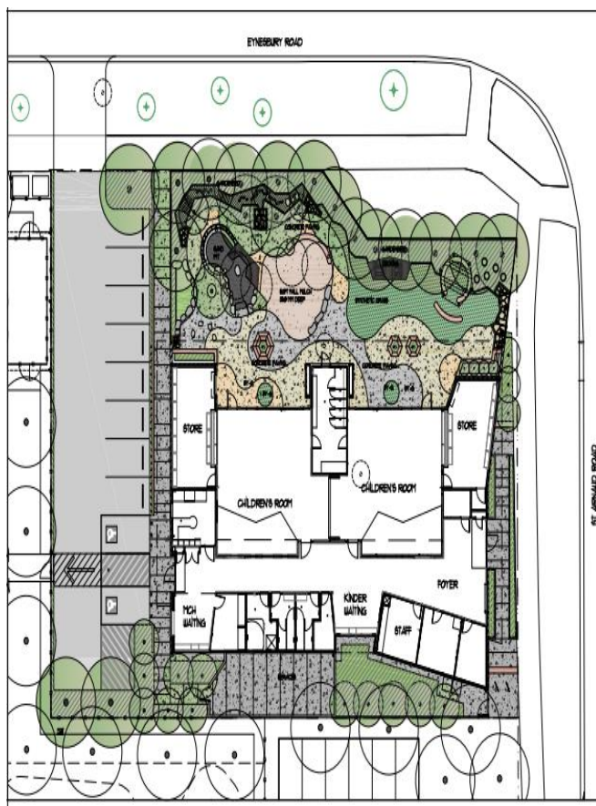
Figure 1 – Eynesbury Station Early Learning Centre Schematic Plan (Melton City Council)

Email: gsf@delwp.vic.gov.au or phone: 9948 8536