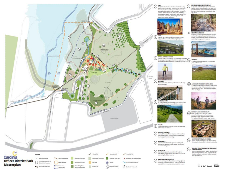
Figure 1 – Officer District Park Masterplan (source: Cardinia Shire Council)

Growing Suburbs Fund contributes to a mix of infrastructure projects that have a direct benefit to communities living in the outer suburbs.