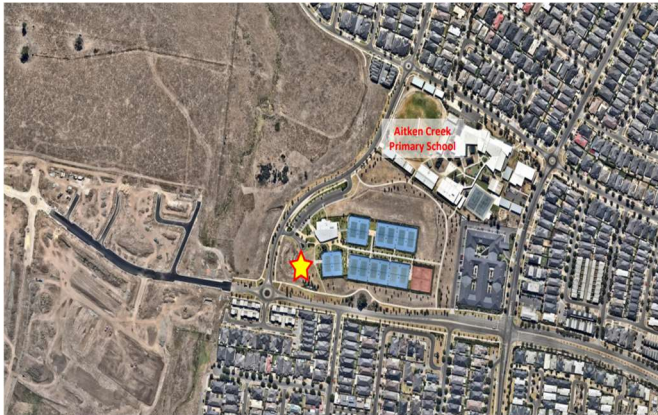
Figure 1: Aerial view

Other contributions: Hume City Council contributes $485,000