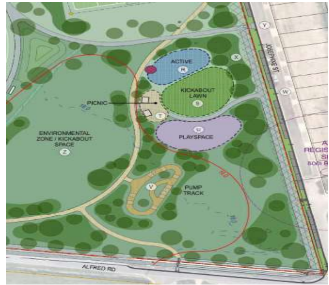
Figure 2 – Concept design

You can find out about other Growing Suburbs Fund projects at https://www.localgovernment.vic.gov.au/grants/growing-suburbs-fund .