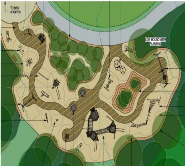
Figure 1 - Main playground schematic plan