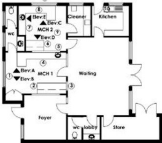
Figure 1 Existing Floor Plan