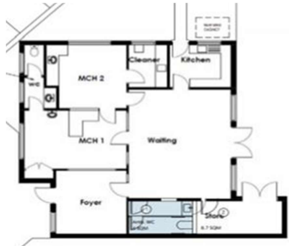
Figure 2 Proposed Floor Plan

You can find out about other Growing Suburbs Fund projects at https://www.localgovernment.vic.gov.au/grants/growing-suburbs-fund .