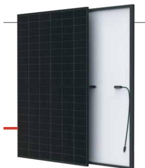
Figure 1: Solar panels