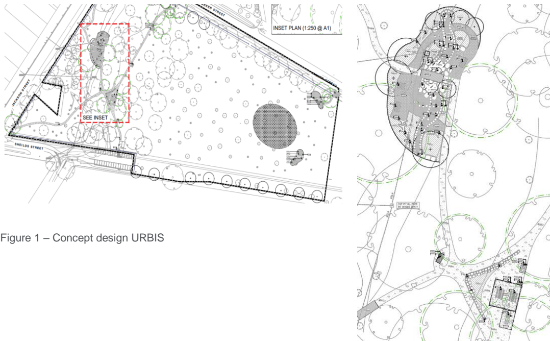
Figure 1 – Concept design URBIS

You can find out about other Growing Suburbs Fund projects at https://www.localgovernment.vic.gov.au/grants/growing-suburbs-fund