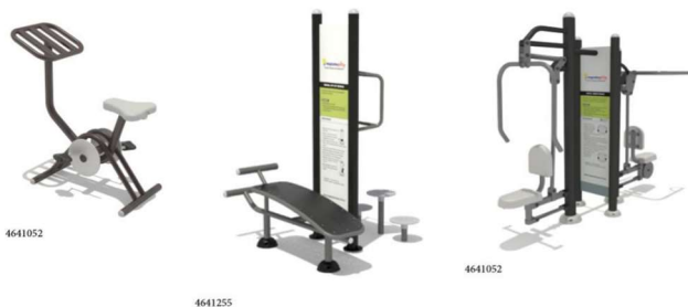
Figure 3 – Outdoor Exercise Hub Concept design

You can find out about other Growing Suburbs Fund Projects at localgovernment.vic.gov.au/gsf