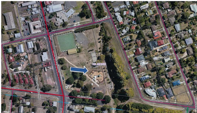
Figure 1 – Kilmore: Project location