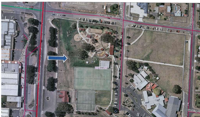
Figure 2 – Wallan - Project location

Expected date of commencement: March 2019