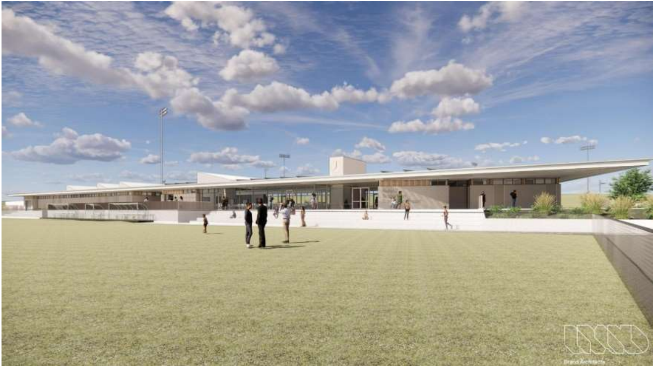
Figure 1 Concept design side elevation

You can find out about other Growing Suburbs Fund projects at https://www.localgovernment.vic.gov.au/grants/growing-suburbs-fund .