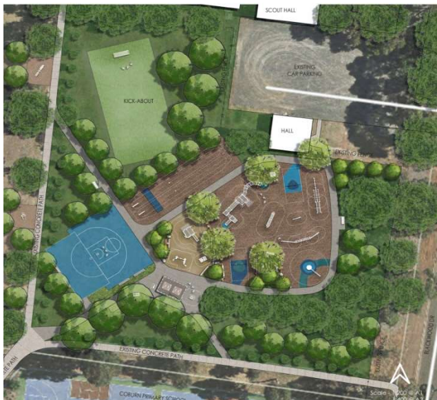
Figure 2 - Concept design

You can find out about other Growing Suburbs Fund projects at https://www.localgovernment.vic.gov.au/grants/growing-suburbs-fund .