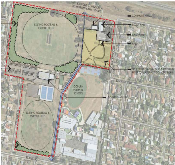
Figure 1 – Site location