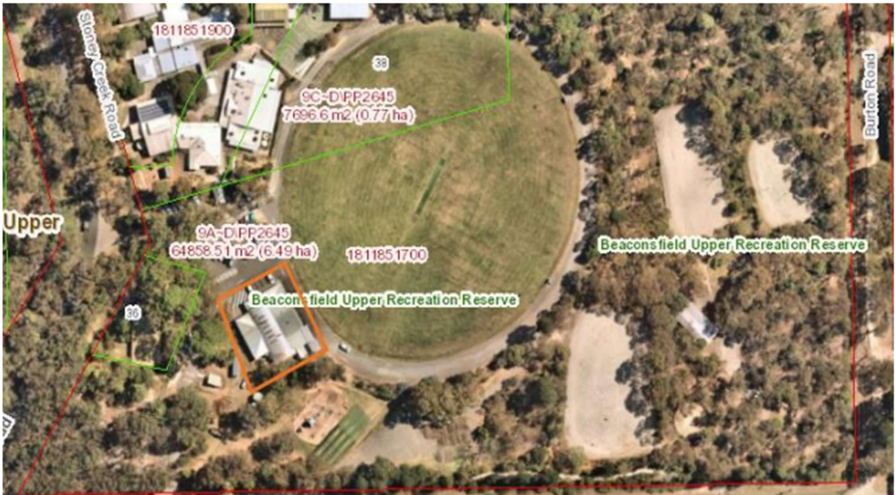
Figure 1 - Aerial Location

You can find out about other Growing Suburbs Fund projects at https://www.localgovernment.vic.gov.au/grants/growing-suburbs-fund .