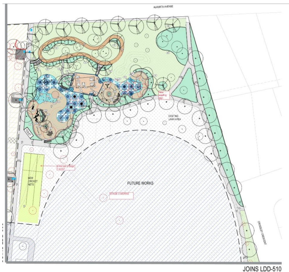
Figure 1 – Concept Design Hansen Partnership

You can find out about other Growing Suburbs Fund projects at https://www.localgovernment.vic.gov.au/grants/growin-g-suburbs-fund