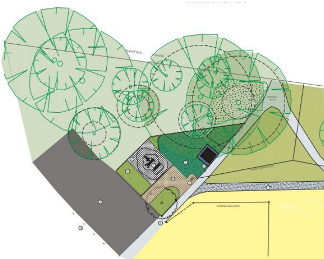
Figure 2: Concept design fitness equipment

This document is also available in an accessible format at djpr.vic.gov.au