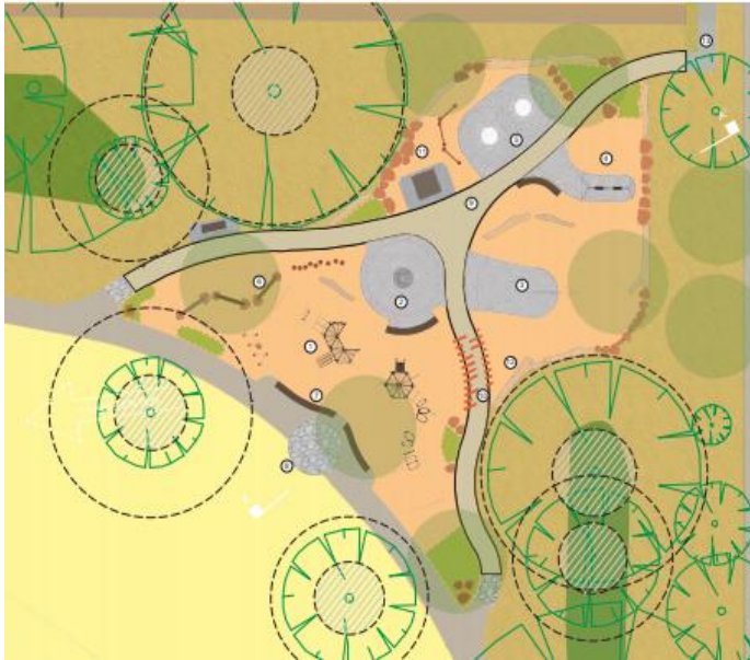
Figure 1: Concept design playground

You can find out about other Growing Suburbs Fund projects at https://www.localgovernment.vic.gov.au/grants/growing-suburbs-fund