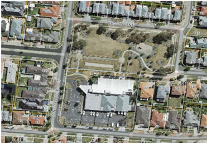
Figure 1 – Central Park Community Centre

Growing Suburbs Fund contributes to a mix of infrastructure projects that have a direct benefit to communities living in the outer suburbs.