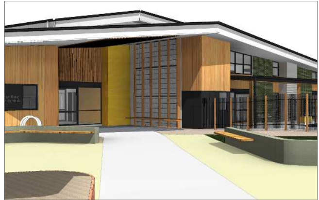
Figure 1: Fraser Rise Community Hub – Concept Design

Growing Suburbs Fund contributes to a mix of infrastructure projects that have a direct benefit to communities living in the outer suburbs.