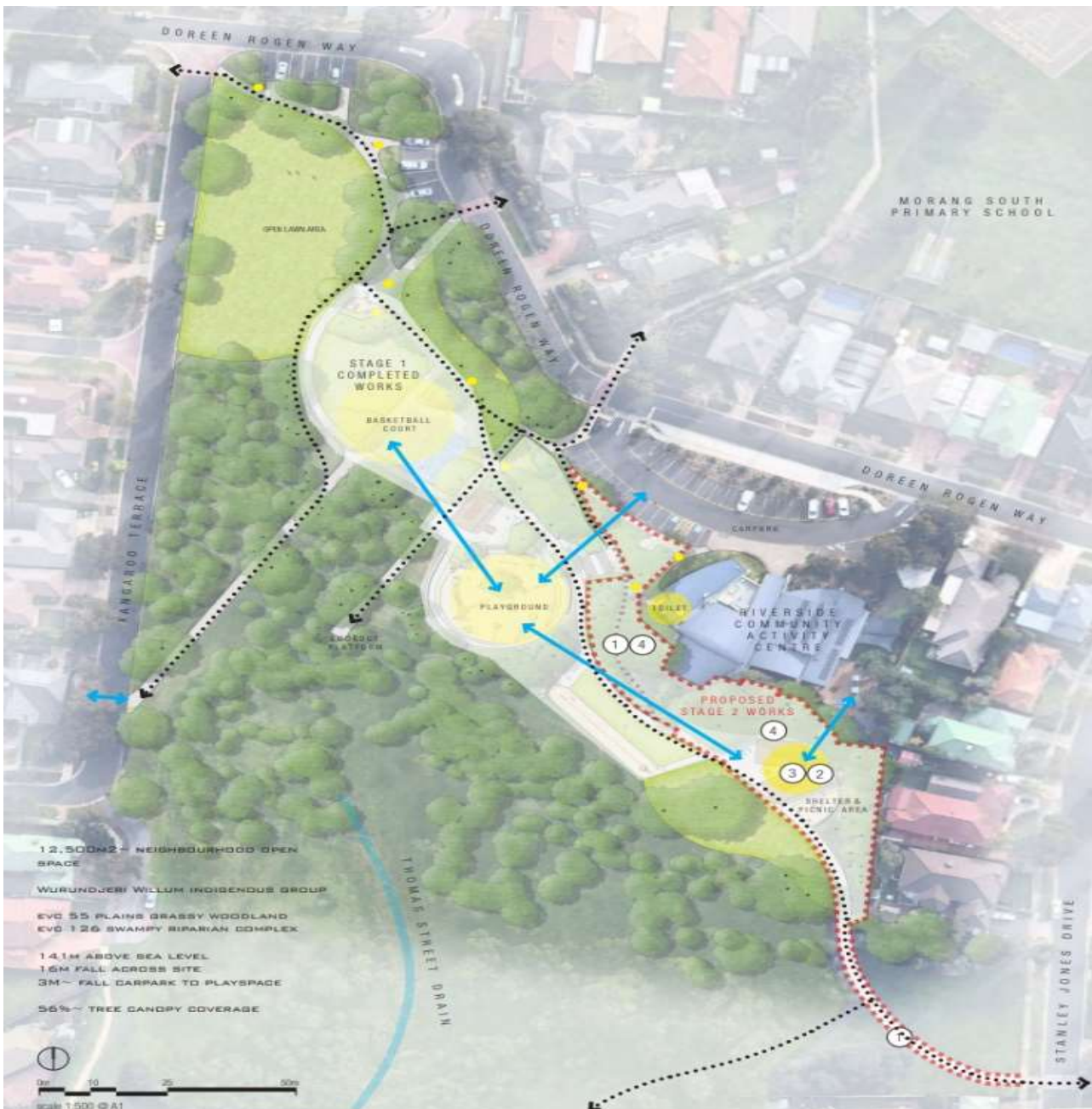
Figure 1 - Works to Riverside Reserve

You can find out about other Growing Suburbs Fund projects at https://www.localgovernment.vic.gov.au/grants/growing-suburbs-fund .