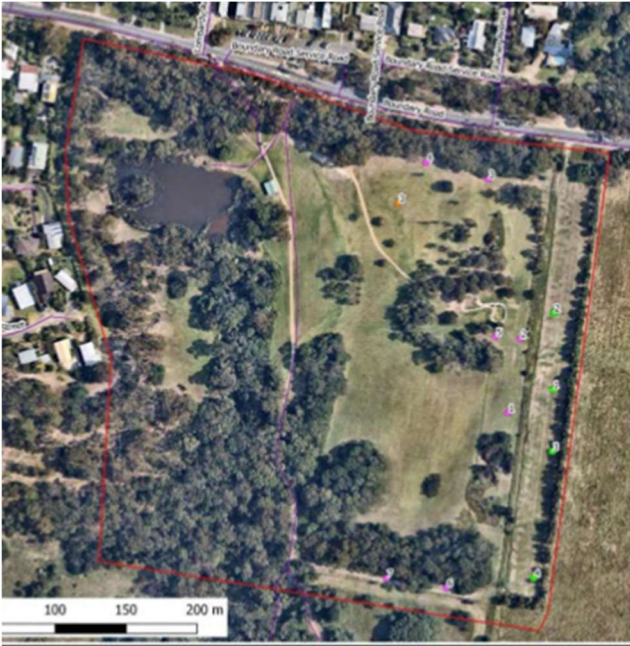
Figure 1 Activity area location