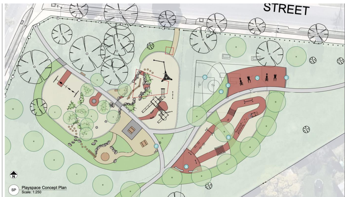
Figure 1 – Concept Design Urban Initiatives

You can find out about other Growing Suburbs Fund projects at https://www.localgovernment.vic.gov.au/grants/growing-suburbs-fund