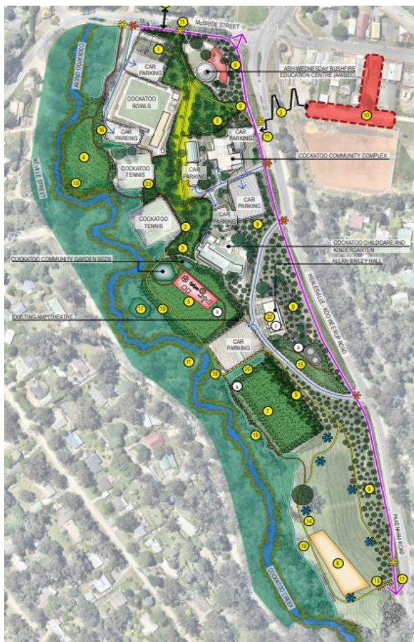
Figure 1: Alma Treloar Master Plan