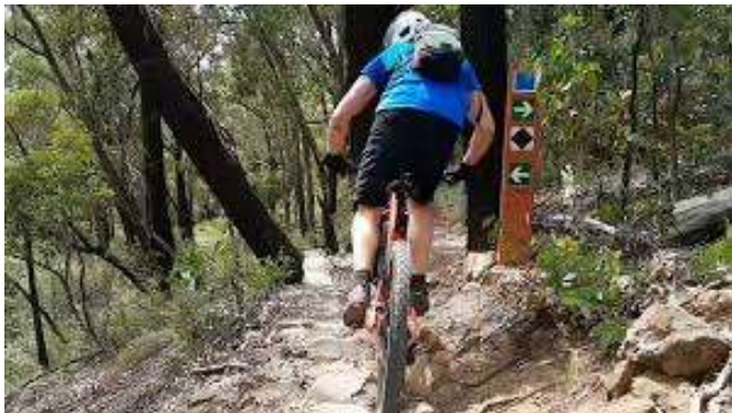
Figure 2 – Cyclist on track

Other projects in Yarra Ranges Shire Council to receive funding from the 2018-19 Growing Suburbs Fund are: