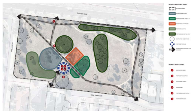
Figure 1 – Friar Park Concept Design

Expected date of commencement: June 2019