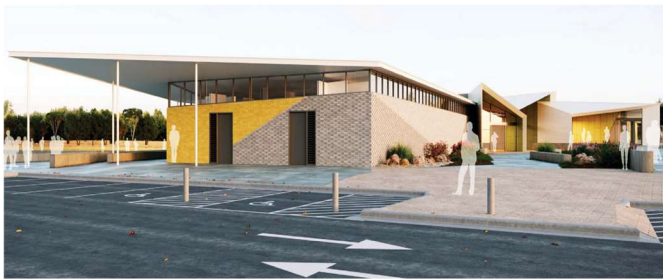
Figure 1 – Concept image

Growing Suburbs Fund contributes to a mix of infrastructure projects that have a direct benefit to communities living in the outer suburbs.