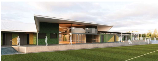
Figure 2 – Concept image (source: Cardinia Shire Council)

© The State of Victoria Department of Environment, Land, Water and Planning 2020