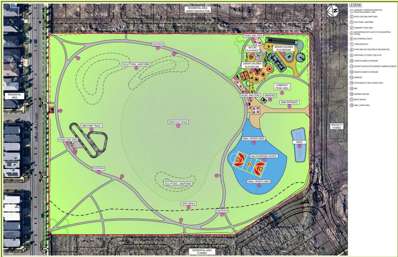
Figure 1 Site Plan

You can find out about other Growing Suburbs Fund projects at https://www.localgovernment.vic.gov.au/grants/growing-suburbs-fund .