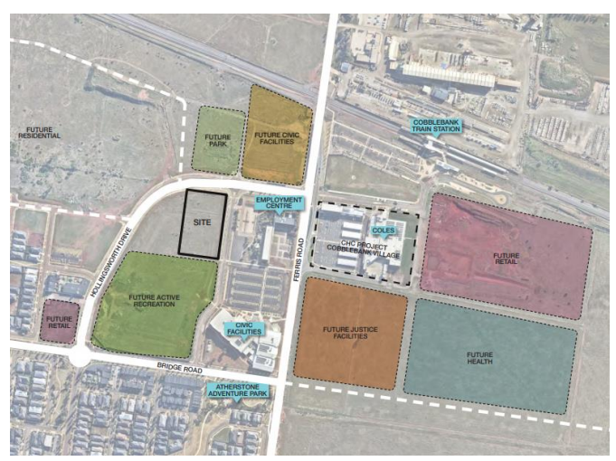
Figure 1: Location