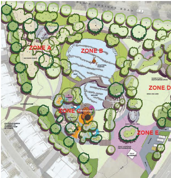
Figure 1: Concept design

You can find out about other Growing Suburbs Fund projects at https://www.localgovernment.vic.gov.au/grants/growing-suburbs-fund