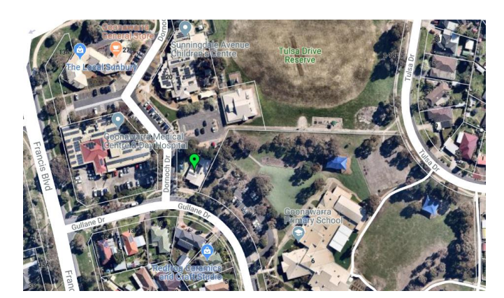
Figure 1: Goonawarra Neighbourhood House location (Hume City Council)