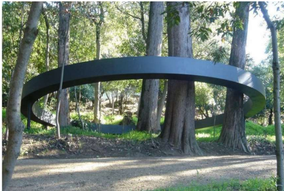
Figure 2 - Rui Chafes, The World Becomes Silent, 2004

Growing Suburbs Fund contributes to a mix of infrastructure projects that have a direct benefit to communities living in the outer suburbs.