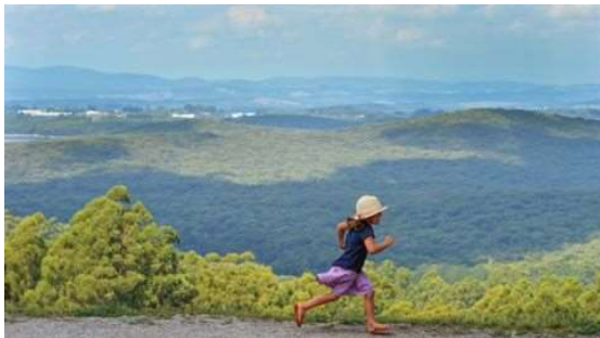
Figure 1 – Kalorama Lookout

Yarra Ranges Shire Council received a total of $8.75 million for four projects under the Growing Suburbs Fund 2018 – 2019.