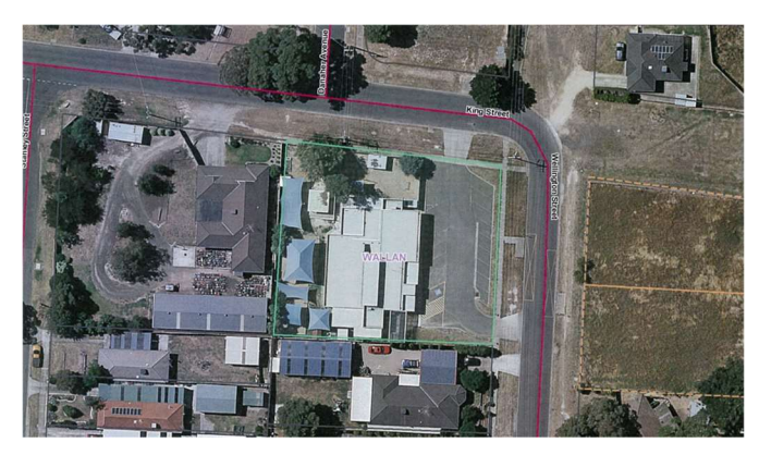
Figure 1 - Project location