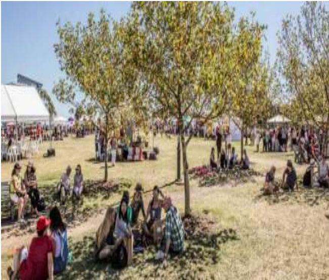
Figure 1 – Concept design