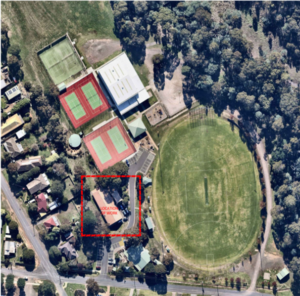
Figure 1 – Aerial shot of project site