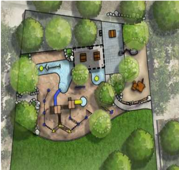
Figure 1 – Concept design