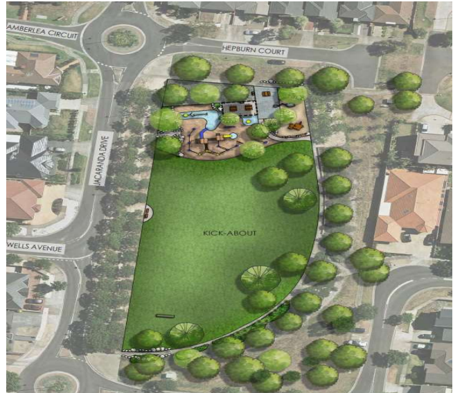
Figure 2 - Landscape concept design

You can find out about other Growing Suburbs Fund projects at https://www.localgovernment.vic.gov.au/grants/growing-suburbs-fund .