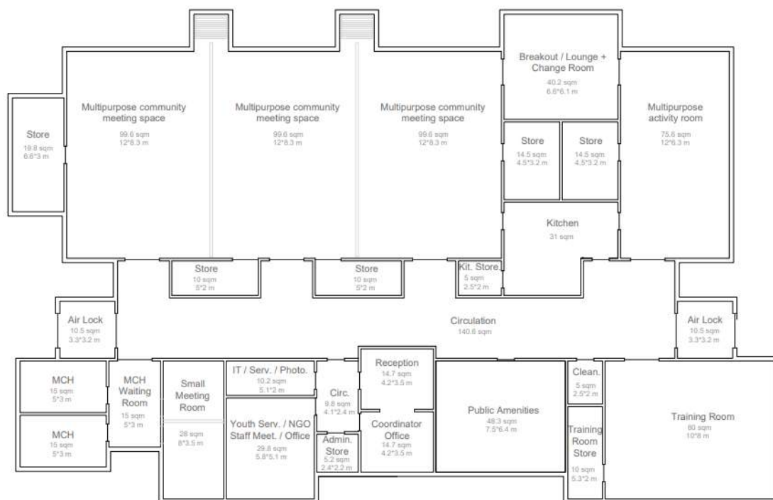
Figure 1 Layout Plan

You can find out about other Growing Suburbs Fund projects at https://www.localgovernment.vic.gov.au/grants/growing-suburbs-fund .